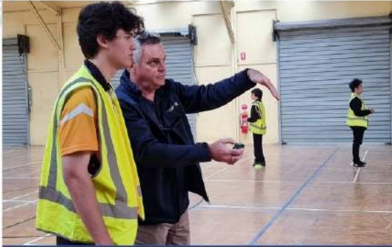
Year 10 students getting hands-on with drones