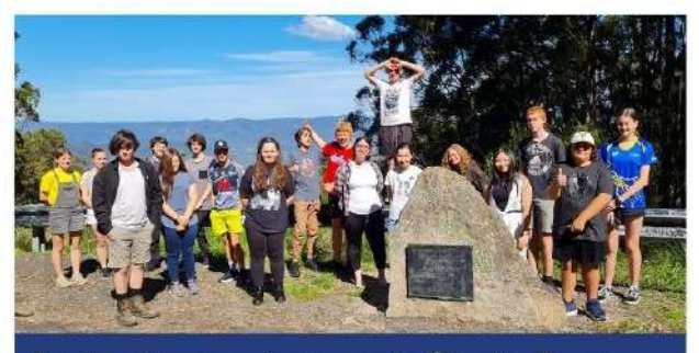
Sunday afternoon, almost over the Gibraltar Range

This excursion was organised by RASE for the three high schools in our academy. Students who had participated in RASE activities throughout the year were invited to submit an EOI. Some of these activities included drone workshops, Bottle rocket challenge, STEM design thinking workshops, and STEM activities at the stage 4 gala day. The excursion was funded through a grant from the Children and Young People Wellbeing Recovery Initiative, a contribution from Rural Industry Education Partnership (RIEP), RASE and a contribution from each student.