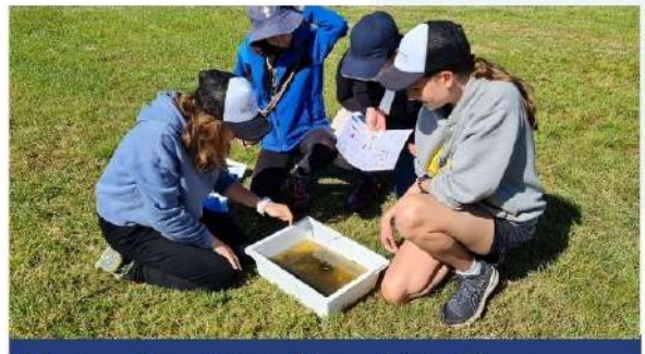
Nater quality activity at Bingara Living Classroom