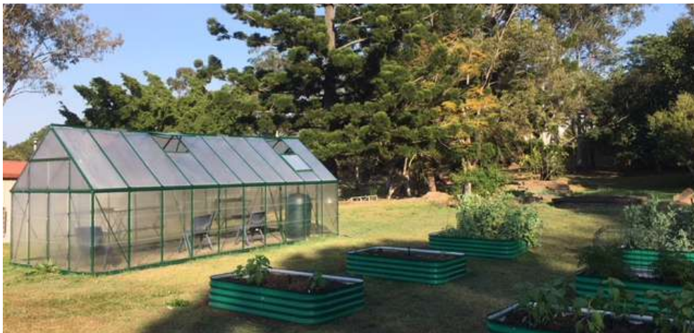
New agriculture area