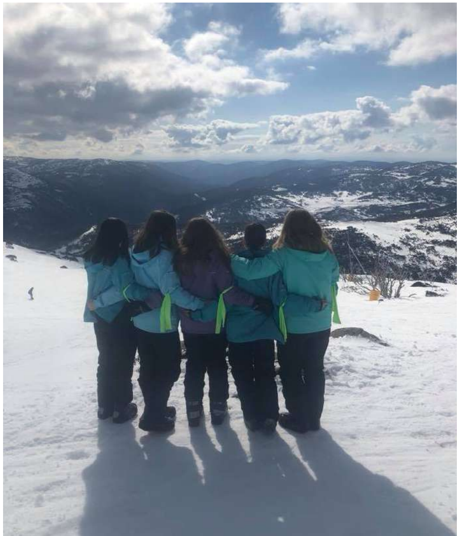
LHC and KHC students on the Ski Trip.

Next meeting is this Monday 3 September 2018 at 6pm. All welcome.